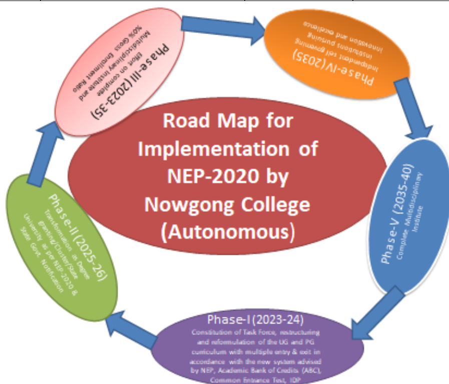
Fig.1: Implementation Plan of NEP-2020 by Nowgong College (Autonomous)